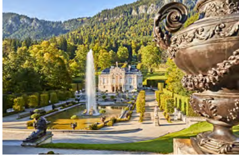
Linderhof: It's the smallest palace commissioned by King Ludwig II

Transfer from Garmisch-Partenkirchen to Zugspitze and ascend by cable car (20 m*)