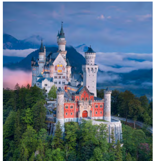
Neuschwanstein Castle: One of the best known buildings in the world