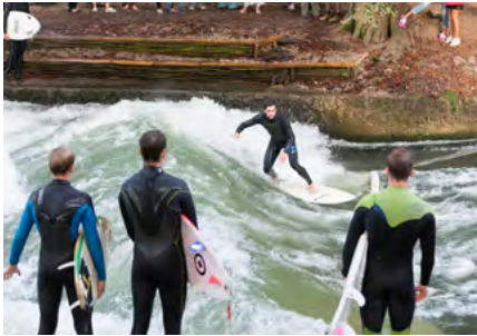
River surfing: Surfers ride waves even in winter