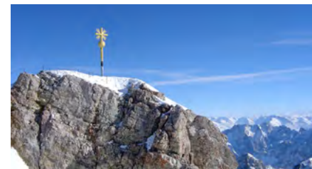
Top of Germany: Enjoy a beer at the highest beer garden in Germany

Back to nature, back to your roots in Garmisch-Partenkirchen . The varied landscape at the foot of the Zugspitze has lots to offer both in summer and in winter. On the slopes, during a mountain hike, or biking – the Bavarian Alps offer you countless opportunities to experience eventful moments.