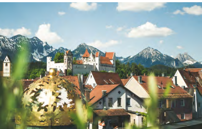
Füssen: The town is over 700 years old and is the cradle of lute-making in Europe