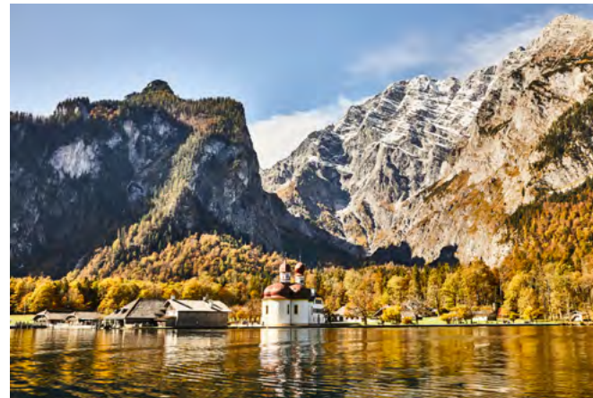
Lake Königssee: A gem at the Berchtesgaden National Park