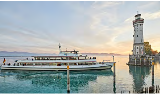
Ahoy: Lake Constance is the 3rd largest inland lake in Europe