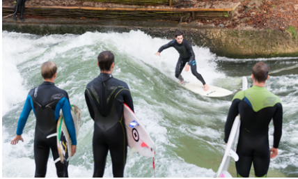
River surfing: Surfers ride waves even in winter