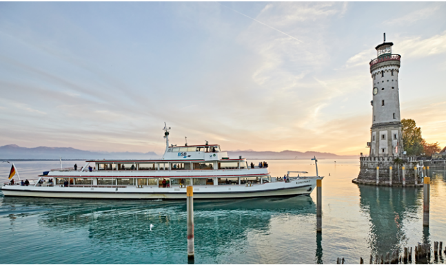
Ahoy: Lake Constance is the 3rd largest inland lake in Europe