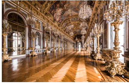
Bavarian Versailles: The Great Hall of Mirrors includes 100 meter mirrors