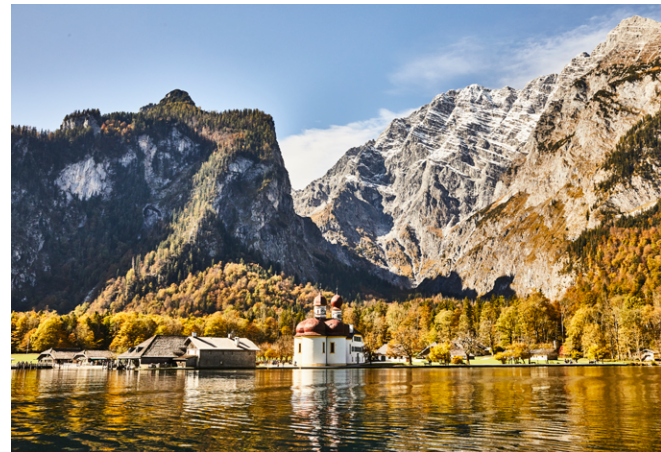
Lake Königssee: A gem at the Berchtesgaden National Park