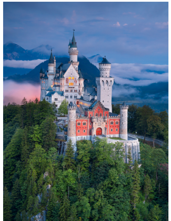
Neuschwanstein Castle: One of the best known buildings in the world