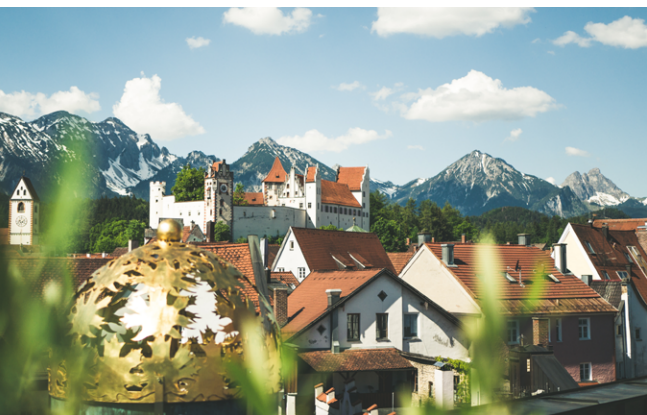
Füssen: The town is over 700 years old and is the cradle of lute-making in Europe

Explore the Baroque churches, St. Magnus Abbey and medieval town walls.