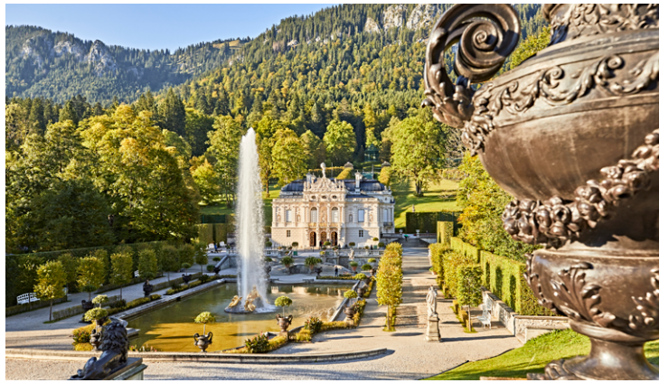
Linderhof: It's the smallest palace commissioned by King Ludwig II