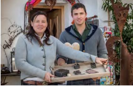
Moor soap: A treasure for body and soul