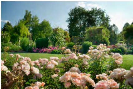
Senses: Spa Park includes a scent and aroma garden