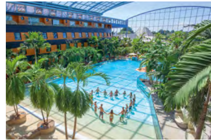
Therme Erding: Offers over 30 pools and saunas

* Please note: Transfer times are approximate and can depend on road conditions on the day of travel.