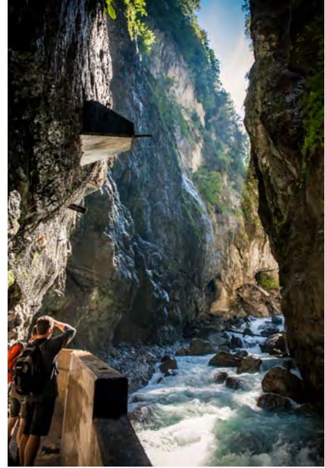
Partnach Gorge: Perfect hike activity with impressive views