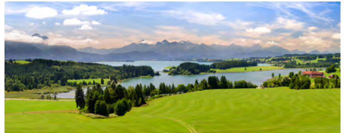
Lake Forggensee: Did you know that it’s a man-made lake?