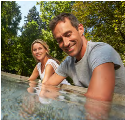
Hydrotherapy: Water is a key to Kneipp’s healing methods