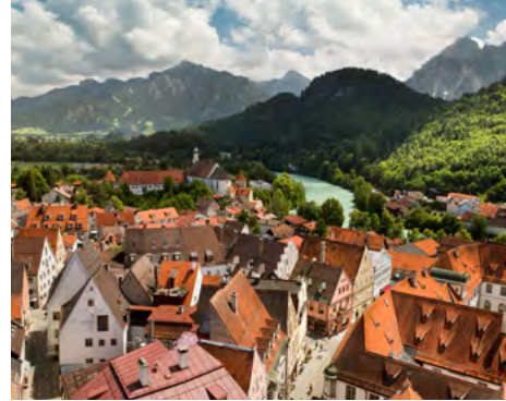
Füssen: Did you know Füssen is surrounded by a few lakes and the River Lech?