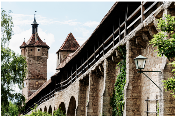
Rothenburg's Tower Trail: Discover history from above along the medieval city wall

Discover charming streets, ancient towers, and the city's rich heritage.