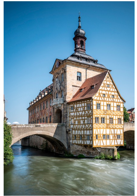
The Old Town Hall: A unique landmark, beautifully perched in the middle of the river