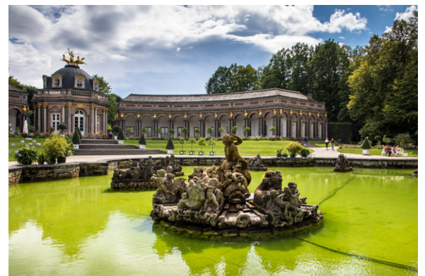
Tranquil beauty at Hermitage Park: A historic gem from the 18th century

The 800-year-old castle features Knight's Halls, unique suites, and ceremonial rooms. Explore the stunning "Sophienhöhle" cave, enjoy falconry displays, regional cuisine, and a 5 km trail used by King Ludwig I.