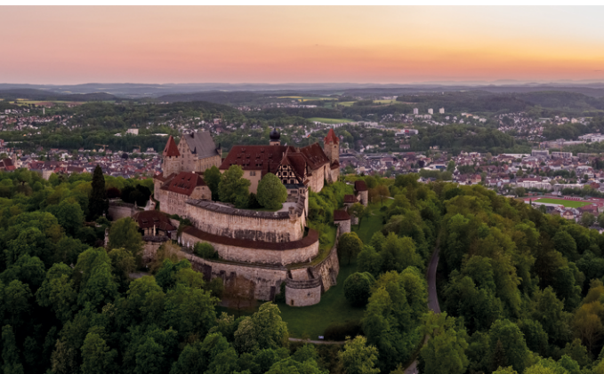
Veste Coburg: The historic fortress overlooking the city