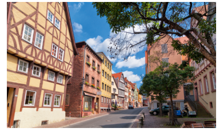
Aschaffenburg: The mediterranean side of Bavaria

Immerse yourself in the vibrant local life of Aschaffenburg's Old Town, stretching from the castle to the town hall. Wander through its narrow, winding streets and charming half-timbered houses.