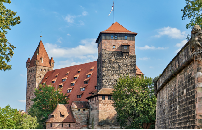
Nuremberg: Enjoy the view of the Imperial Castle