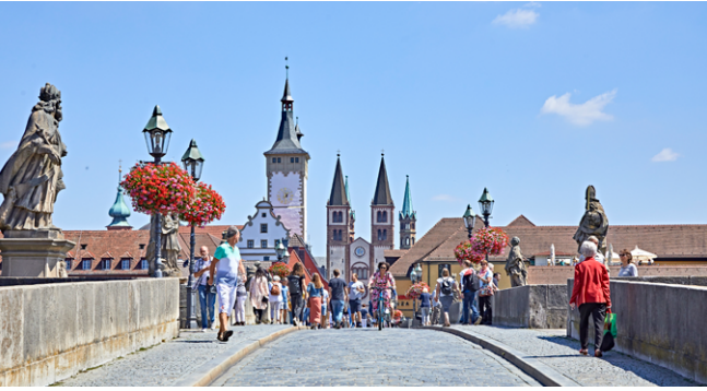
Alte Mainbrücke: One of the city's prime gathering spots for socializing and meeting friends