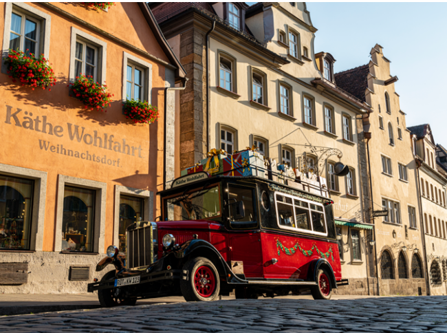
Käthe Wohlfahrt: Enchanting Christmas spirit year-round