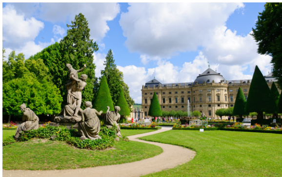
Würzburg Residence: Designed by the then young and unknown architect Balthasar Neumann in the 1700s