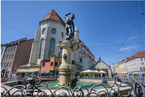
Merkur Fountain: One of the UNESCO World Heritage Site's grand fountains