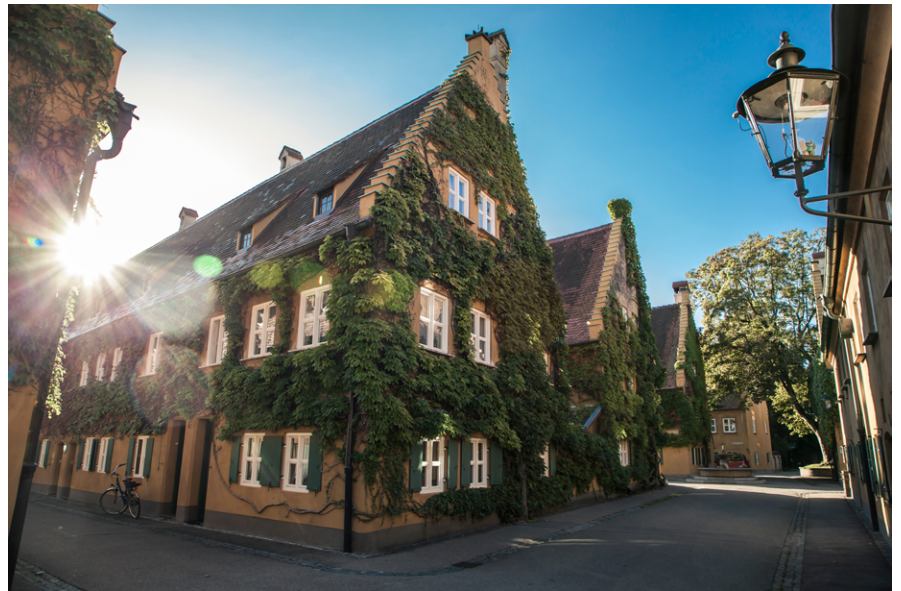
The Fuggerei: Historic social housing