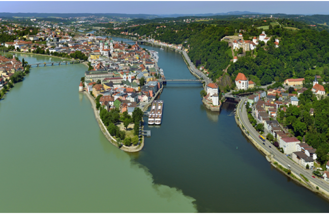
Three-River-Conjunction-Point: Danube, Inn and Ilz meet here