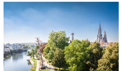
Overlooking the Danube: Ulm Minster

Check-in and overnight in the Plaza Premium Parkhotel Neu-Ulm