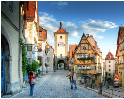
The perfect back drop: Rothenburg's medieval streets and towers