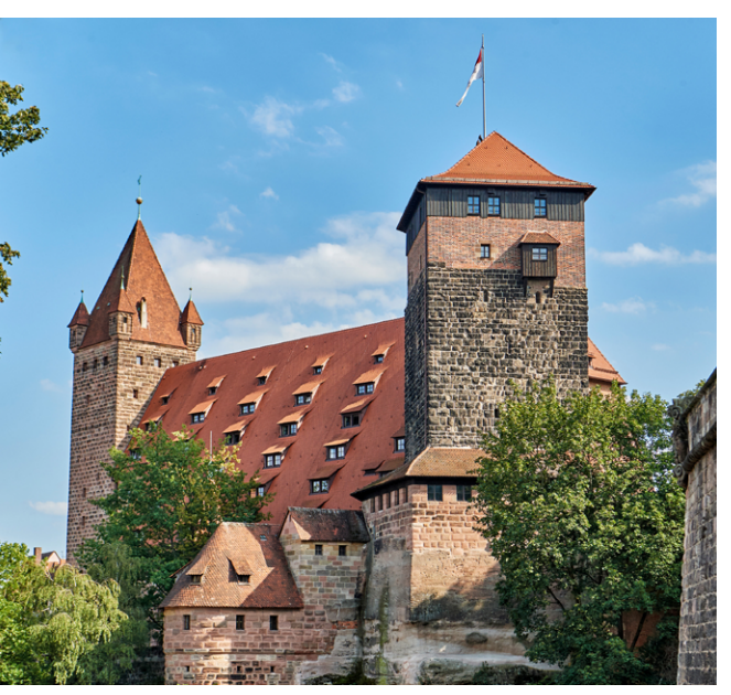
Nuremberg: Enjoy the view of the Imperial Castle