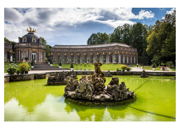
Tranquil beauty at Hermitage Park: A historic gem from the 18th century

The 800-year-old castle features Knight's Halls, unique suites, and ceremonial rooms. Explore the stunning "Sophienhöhle" cave, enjoy falconry displays, regional cuisine, and a 5 km trail used by King Ludwig I.