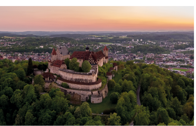
Veste Coburg: The historic fortress overlooking the city