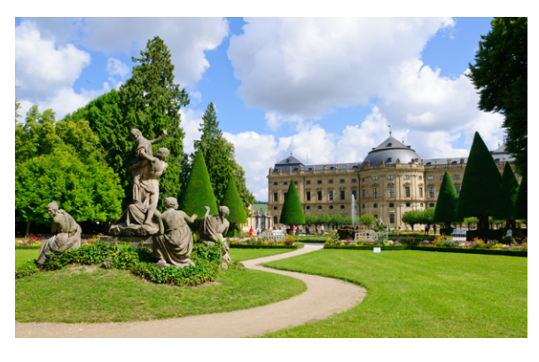
Würzburg Residence: Designed by the then young and unknown architect Balthasar Neumann in the 1700s