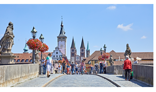
Alte Mainbrücke: One of the city's prime gathering spots for socializing and meeting friends