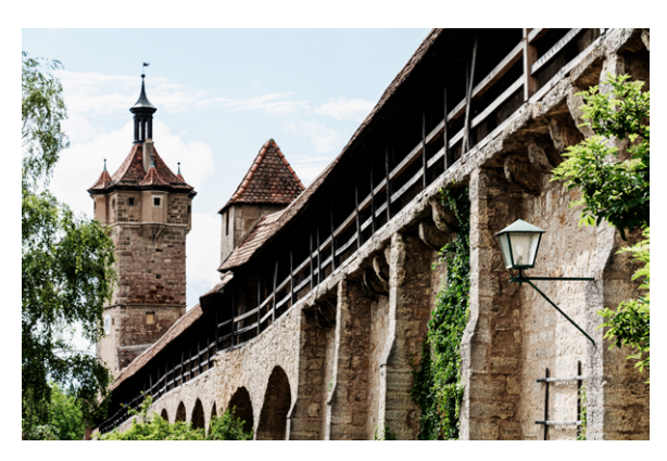
Rothenbura's Tower Trail: Discover history from above along the medieval city wall

Discover charming streets, ancient towers, and the city's rich heritage.