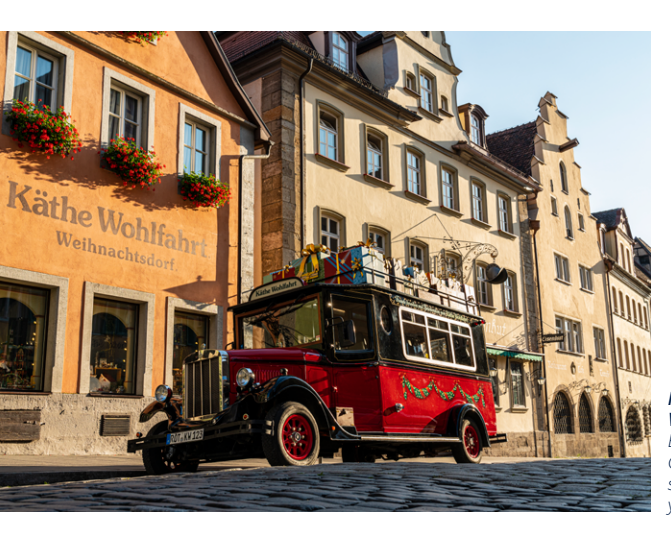
Wohlfahrt: Enchanting Christmas spirit year-round