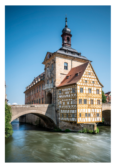
The Old Town Hall: A unique landmark, beautifully perched in the middle of the river