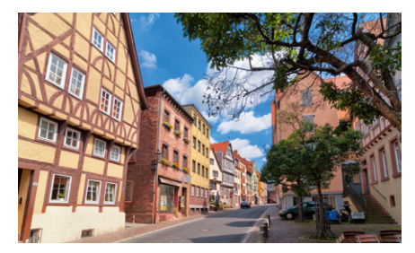
Aschaffenburg: The mediterranean side of Bavaria

Immerse yourself in the vibrant local life of Aschaffenburg's Old Town, stretching from the castle to the town hall. Wander through its narrow, winding streets and charming half-timbered houses.