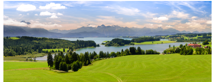
Lake Forggensee: Did you know that it’s a man-made lake?