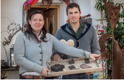
Moor soap: A treasure for body and soul