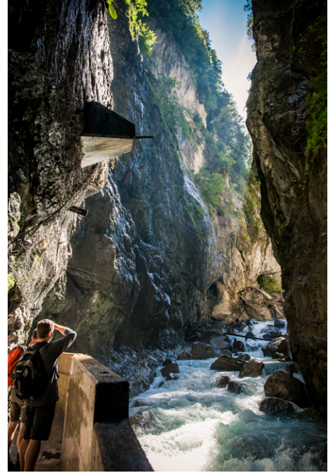
Partnach Gorge: Perfect hike activity with impressive views