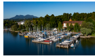
Yachthotel Chiemsee: Luxury wellness amidst stunning lakeside views

Lake Chiemsee , nestled in picturesque Alpine foothills and known as the Bavarian Sea, is the perfect destination for wellness and relaxation. Its serene atmosphere and stunning beauty are complemented by thermal baths and a variety of leisure activities for mind, body and soul. Enjoy and rejuvenate in this idyllic setting.