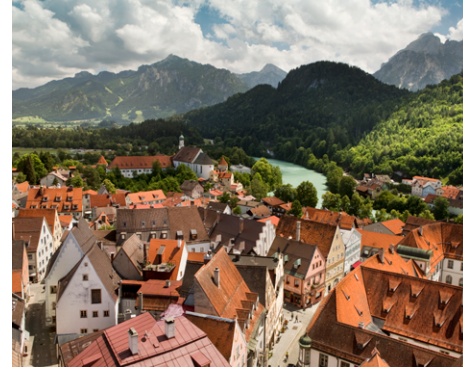
Füssen: Did you know Füssen is surrounded by a few lakes and the River Lech?

TIP For more wellness experiences, visit Lindau and its newly opened Therme Lindau , offering a variety of thermal baths, pools and saunas.