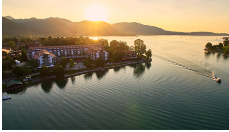
Lake Tegernsee: Tranquil beauty and relaxation